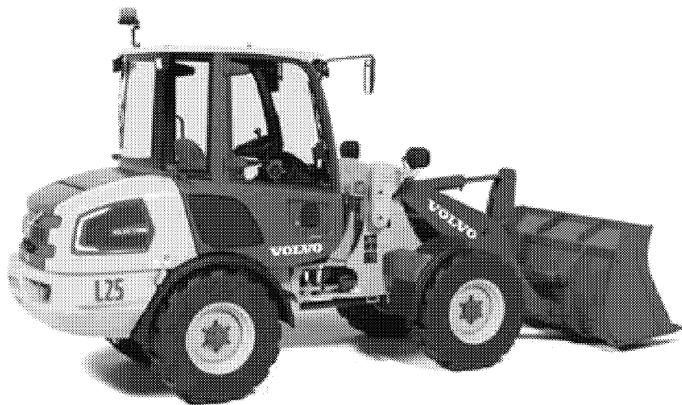
The electric L25.

Volvo Construction Equipment (Volvo CE) is delivering on its commitment of 'Building Tomorrow' with the unveiling of its first commercial zero-emissions electric compact excavator and wheel loader at bauma Munich. The machines, which are the first to be shown from a new electric range of Volvo branded compact excavators and compact wheel loaders, deliver zero exhaust emissions, significantly lower noise levels, reduced energy costs, improved efficiency and less maintenance requirements, compared to their conventional counterparts. From mid-2020, Volvo CE will begin to launch its range of electric compact excavators (EC15 to EC27) and wheel loaders (L20 to L28), stopping new diesel engine-based development of these models.