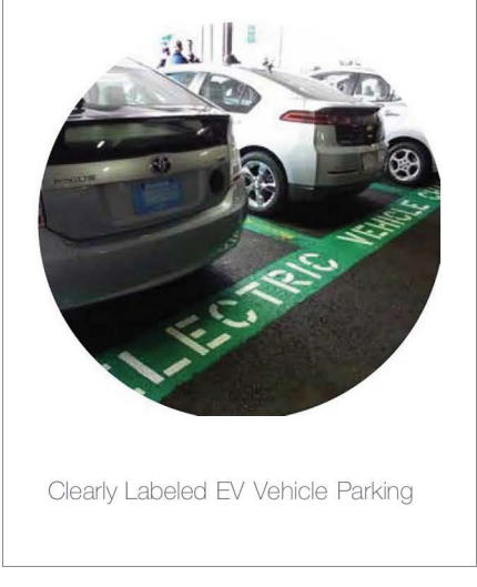
Figure 9.3 Electric Vehicle Charging