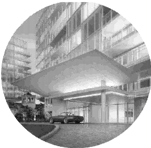
Architecturally Expressed Roofline