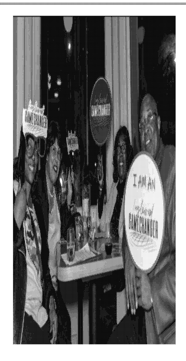
Dear Inglewood Game Changer Champion,

First and foremost, we hope that you and your loved ones are staying safe and healthy during these difficult times.