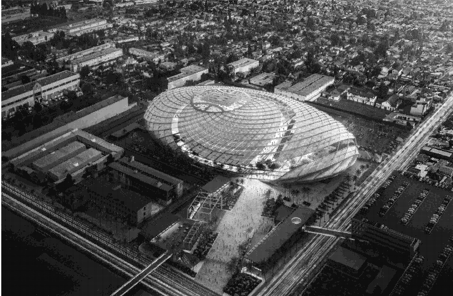
rendering of the Clippers' proposed arena in Inglewood.

The Clippers' plans for a billion-dollar arena complex moved closer to reality Tuesday, July 21, 2020, after Inglewood's City Council voted unanimously to approve the environmental impact report for the project.