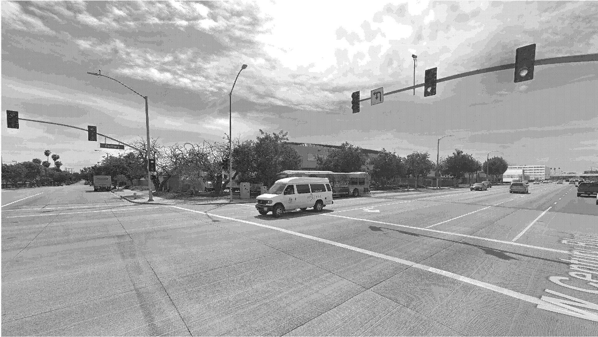
CONCEPT VIEW 5