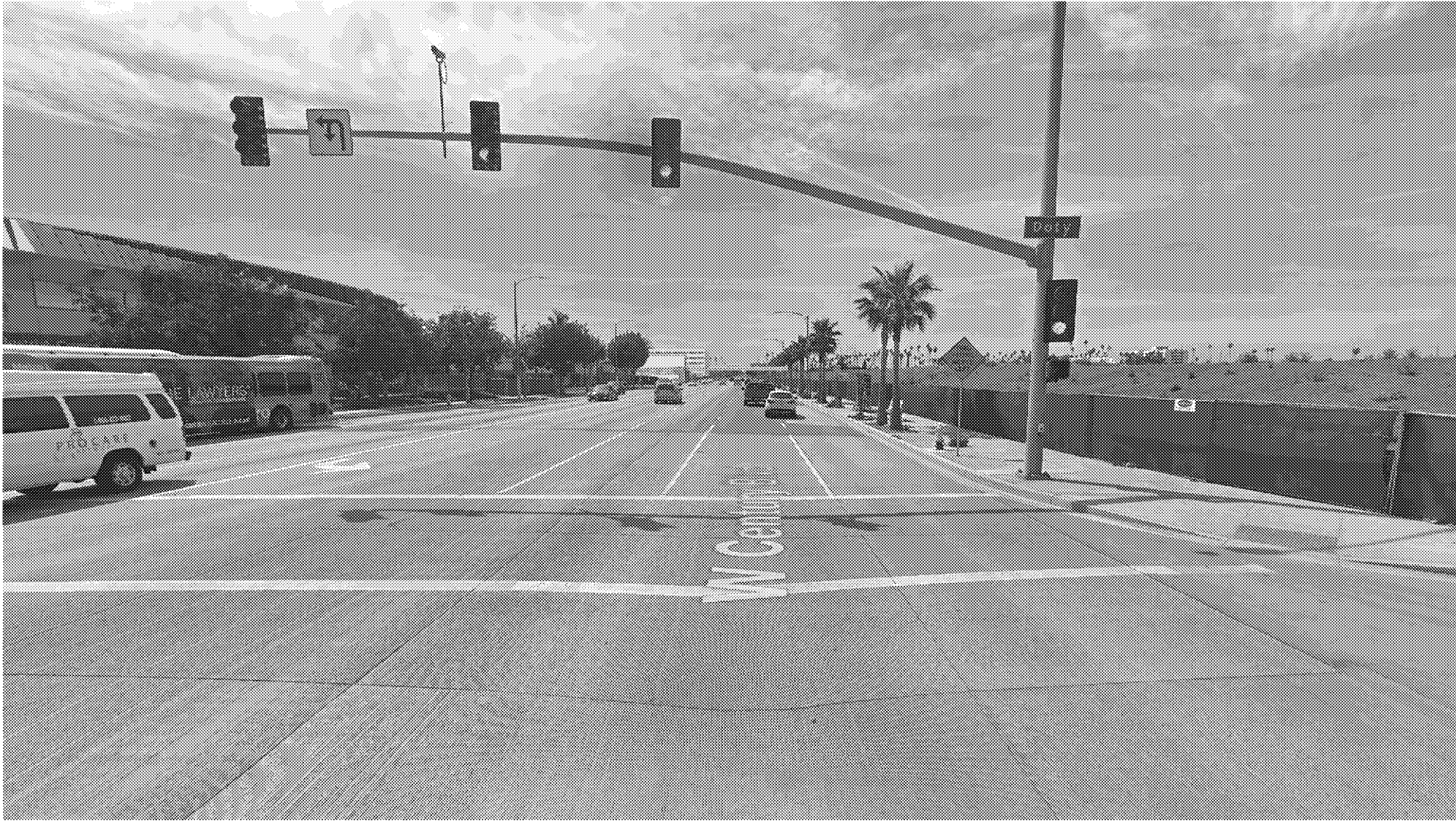
CONCEPT VIEW 4