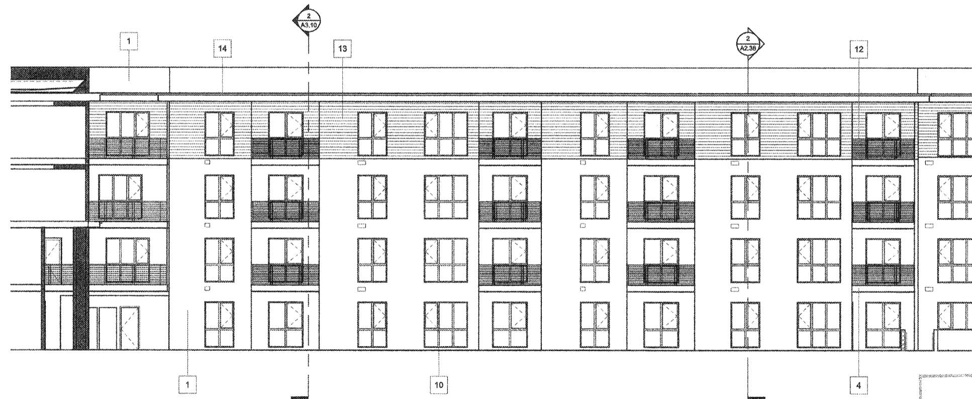
3 COURTYARD A - C 1/8" = 1'-0"