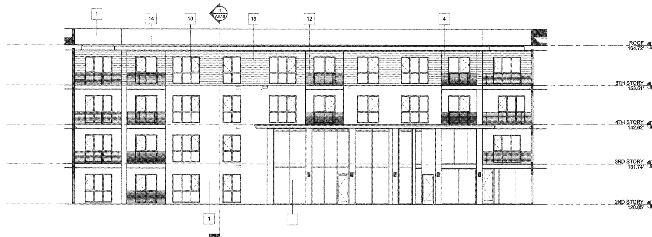
2 COURTYARD A - B 1/8" = 1'-0"