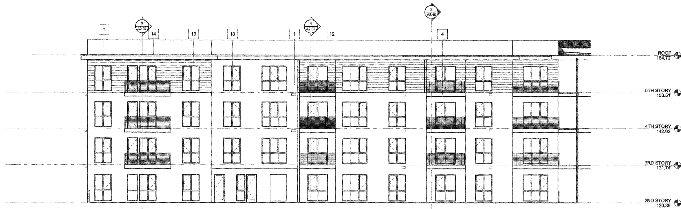
1 COURTYARD A-A 1/8" = 1'-0"