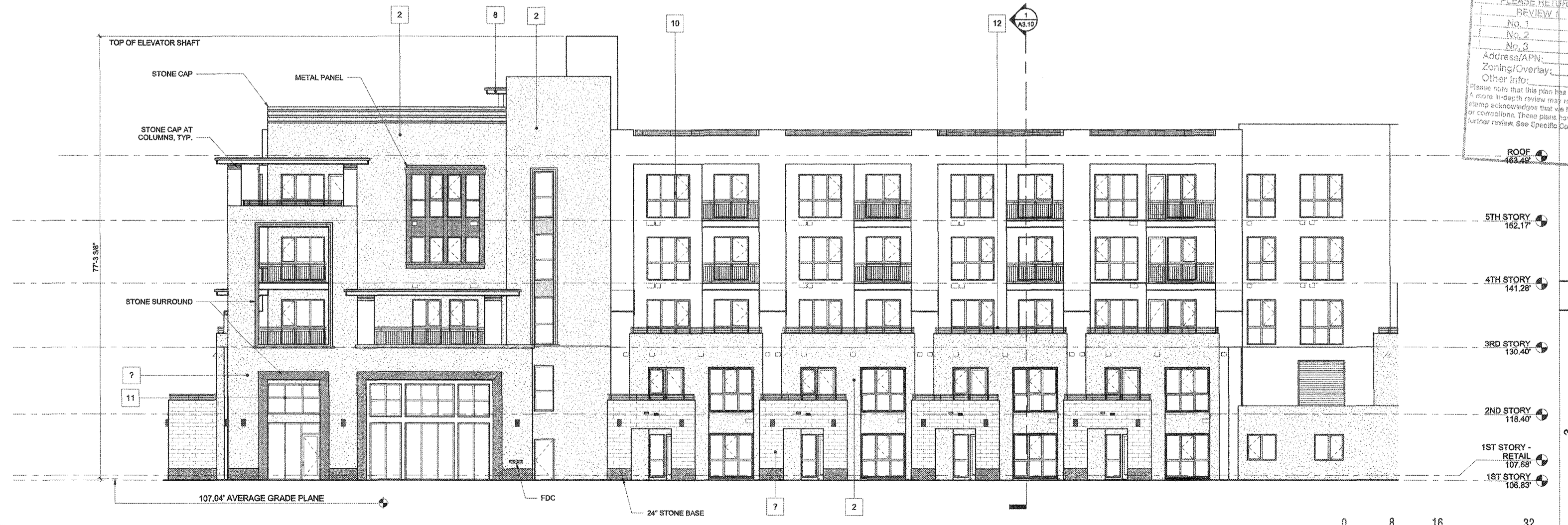
3 MU-2C - WEST ELEVATION 1/8" = 1'-0"