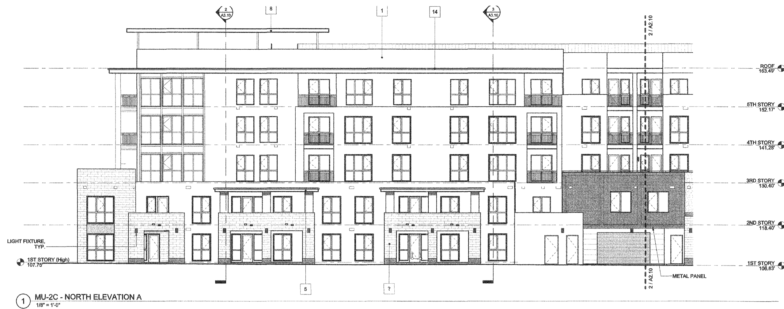
1 MU-2C - NORTH ELEVATION A 1/8" = 1'-0"