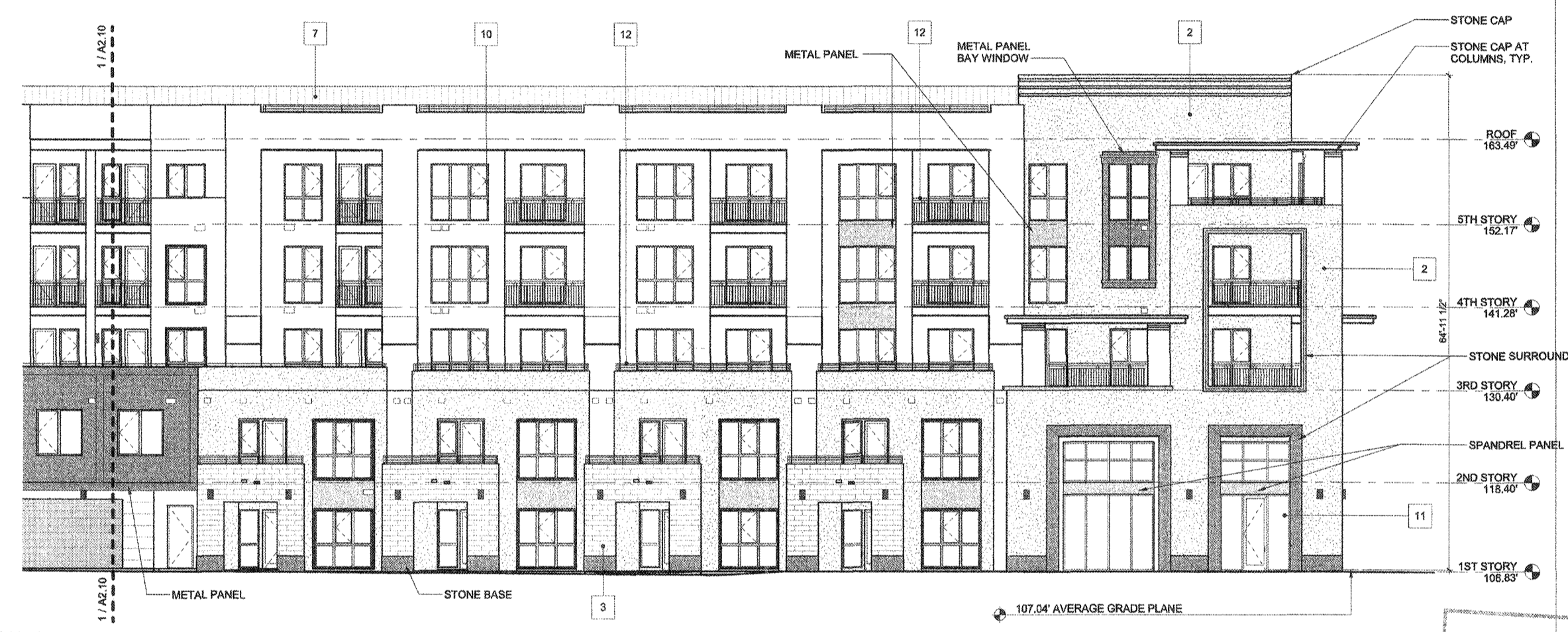
2 MU-2C - NORTH ELEVATION B 1/8" = 1'-0"