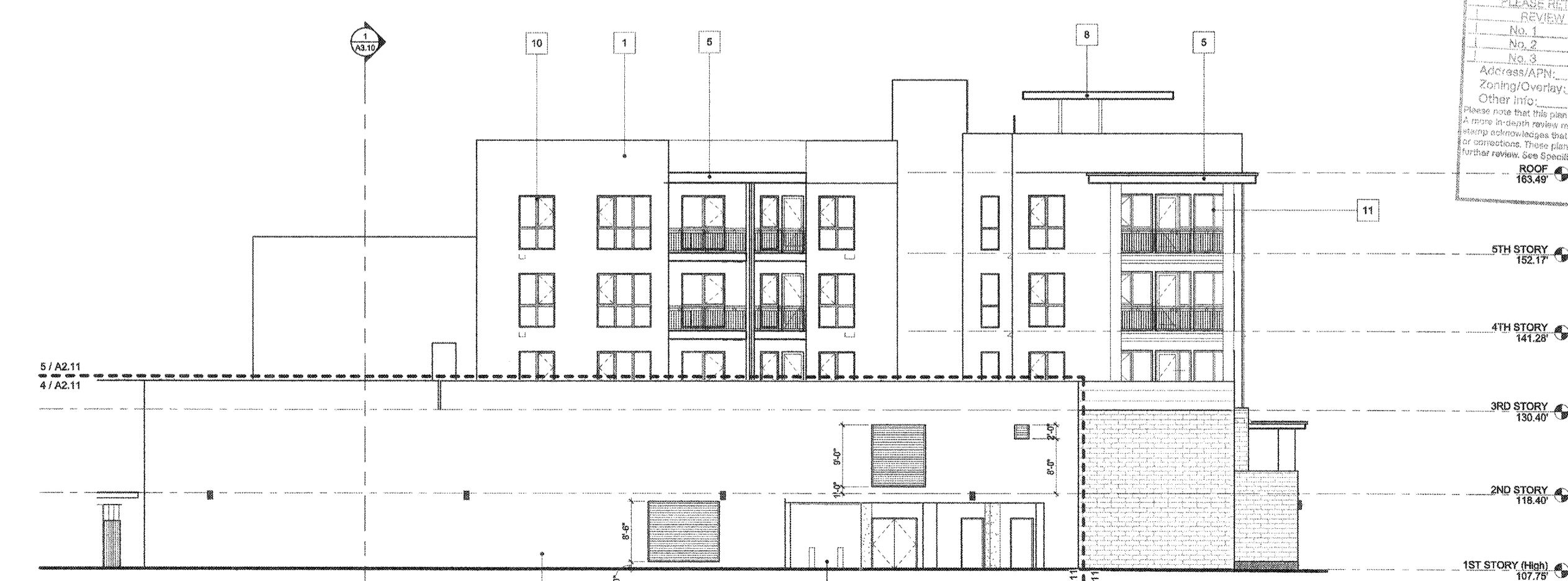
4 MU-2C - GARAGE EAST ELEVATION A 1/8" = 1'-0"