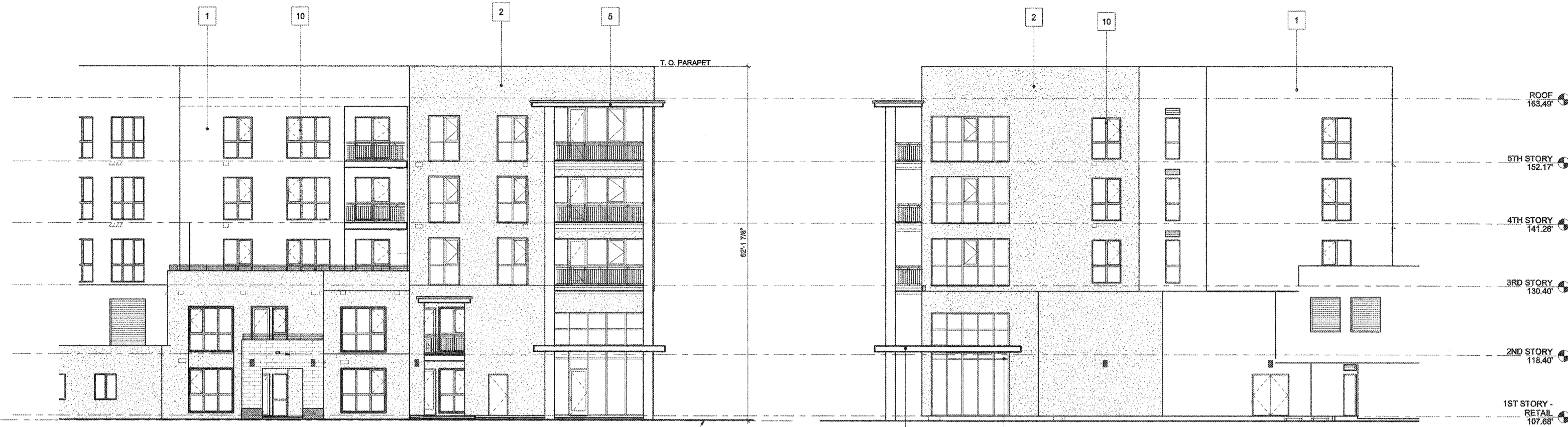
1 MU-2C - SOUTH-WEST ELEVATION 1/8" = 1'-0"