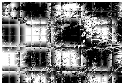
Figure 2 - High Density Landscape Area