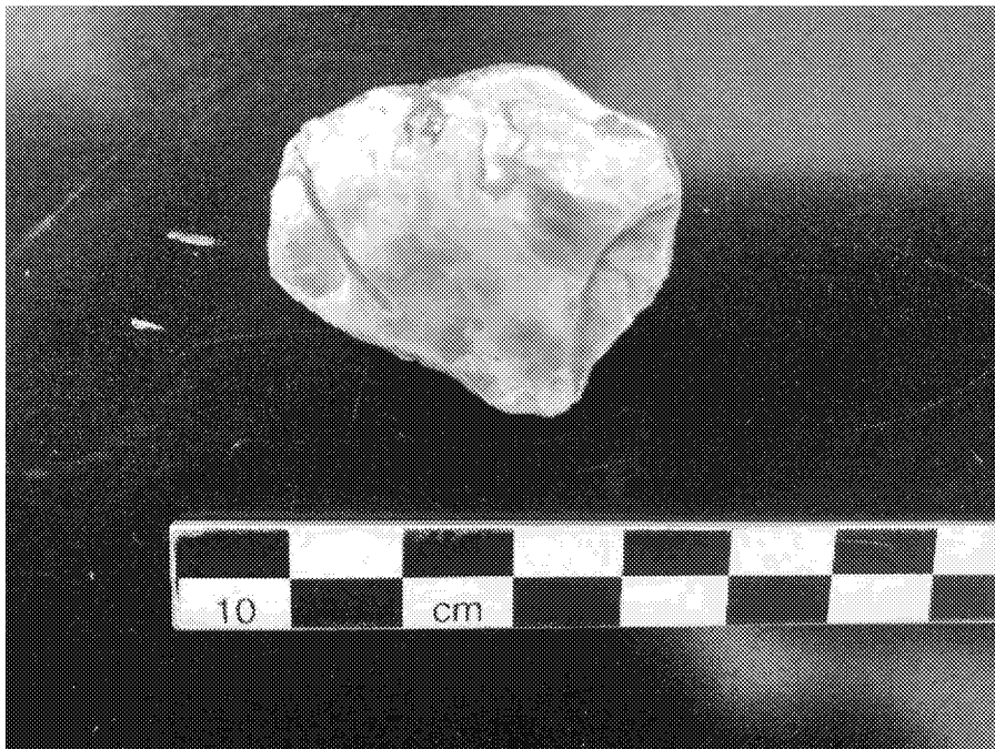
Figure 19 Detail of EAN-1