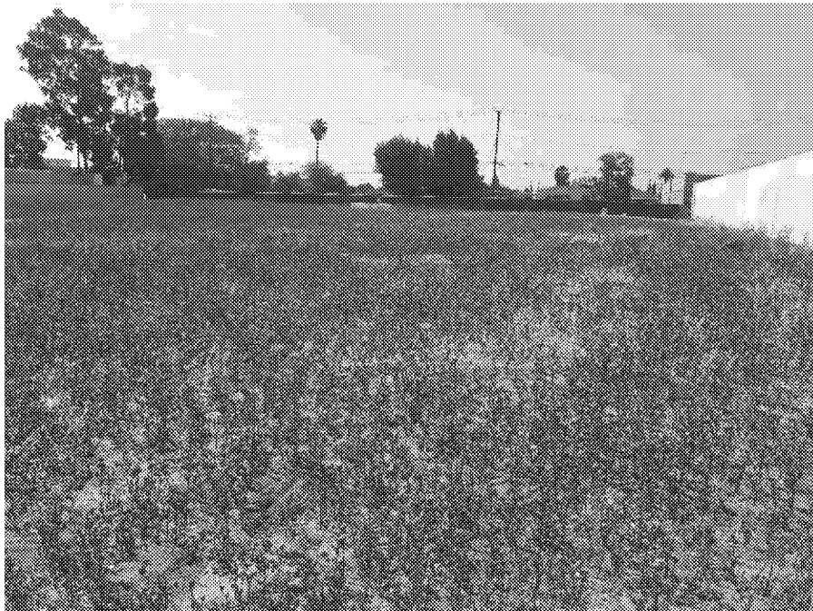
Figure 16 Survey conditions in Well Relocation Site (view to south)