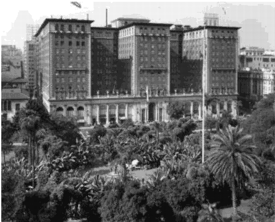
Figure 7 The Hotel Raymond in Pasadena circa 1890