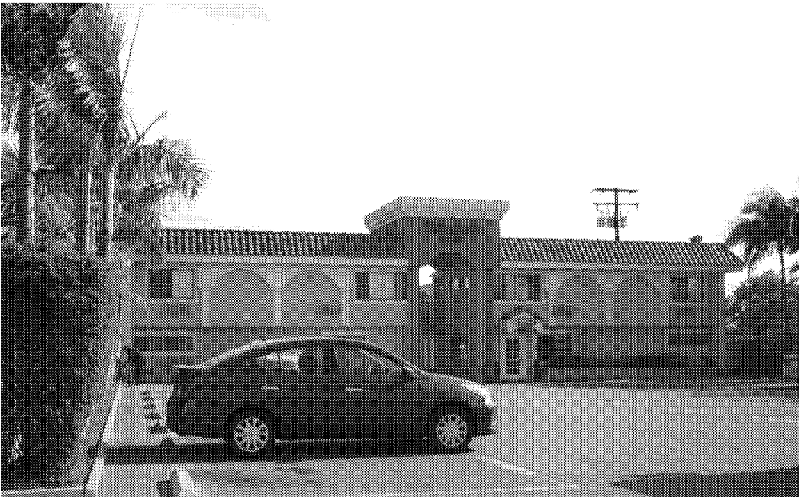
Figure 21 Landscaping and hardscaping of the Hotel