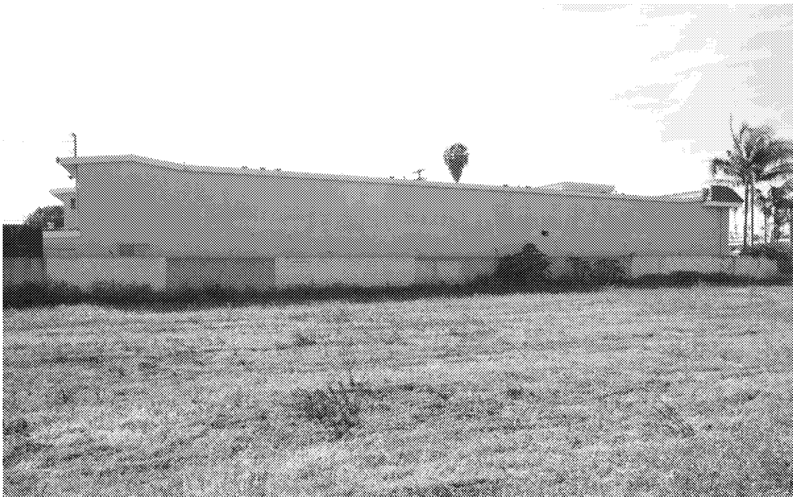
Figure 23 North (primary) façade with a view into the courtyard