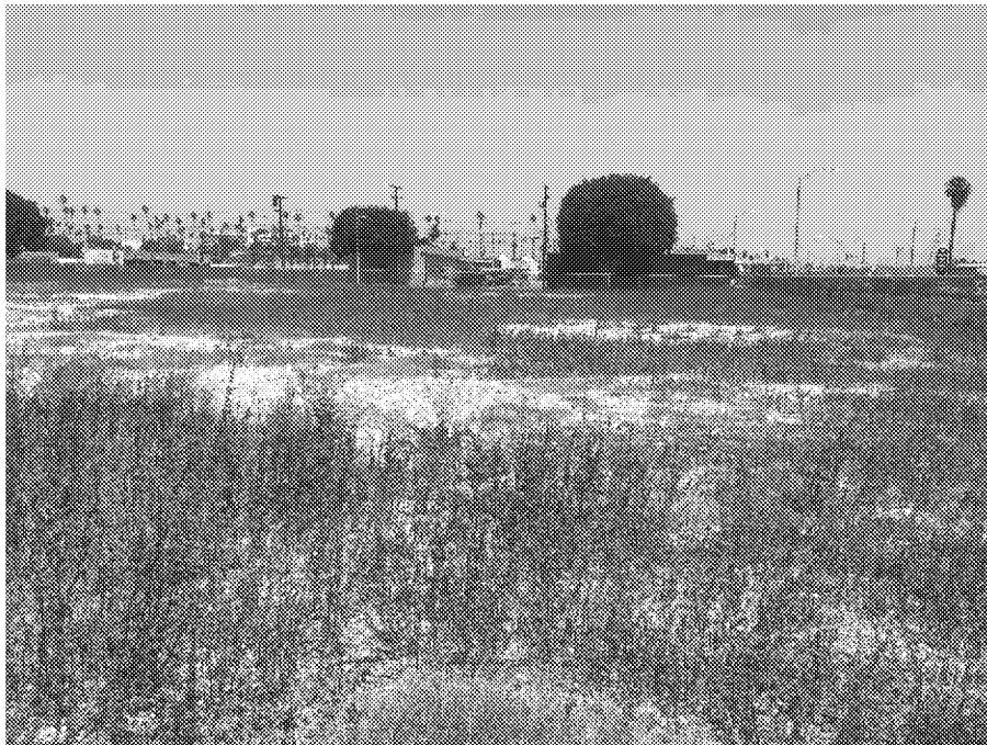
Figure 18 Survey conditions in East Transportation and Hotel Site (view to SE)