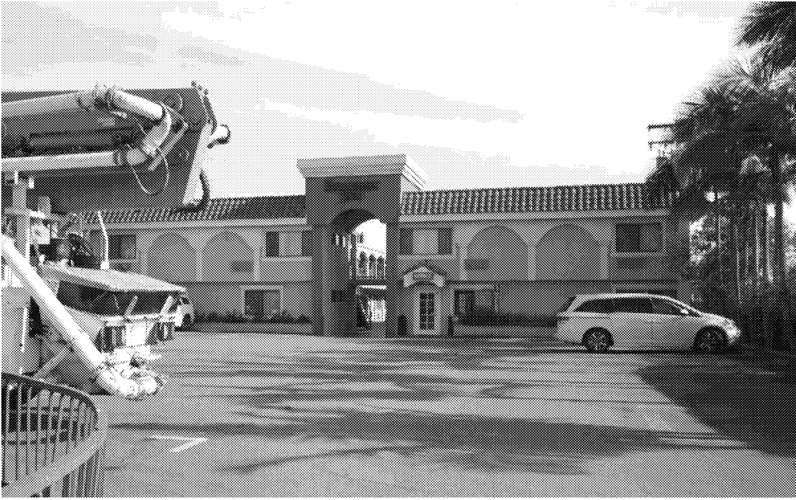
Figure 23 North (front) façade, view facing south