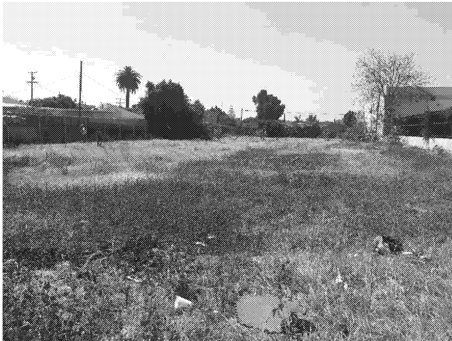
Figure 16 Undeveloped Area within northern portion of Arena Site (previously used as a temporary construction staging area) (view to East)